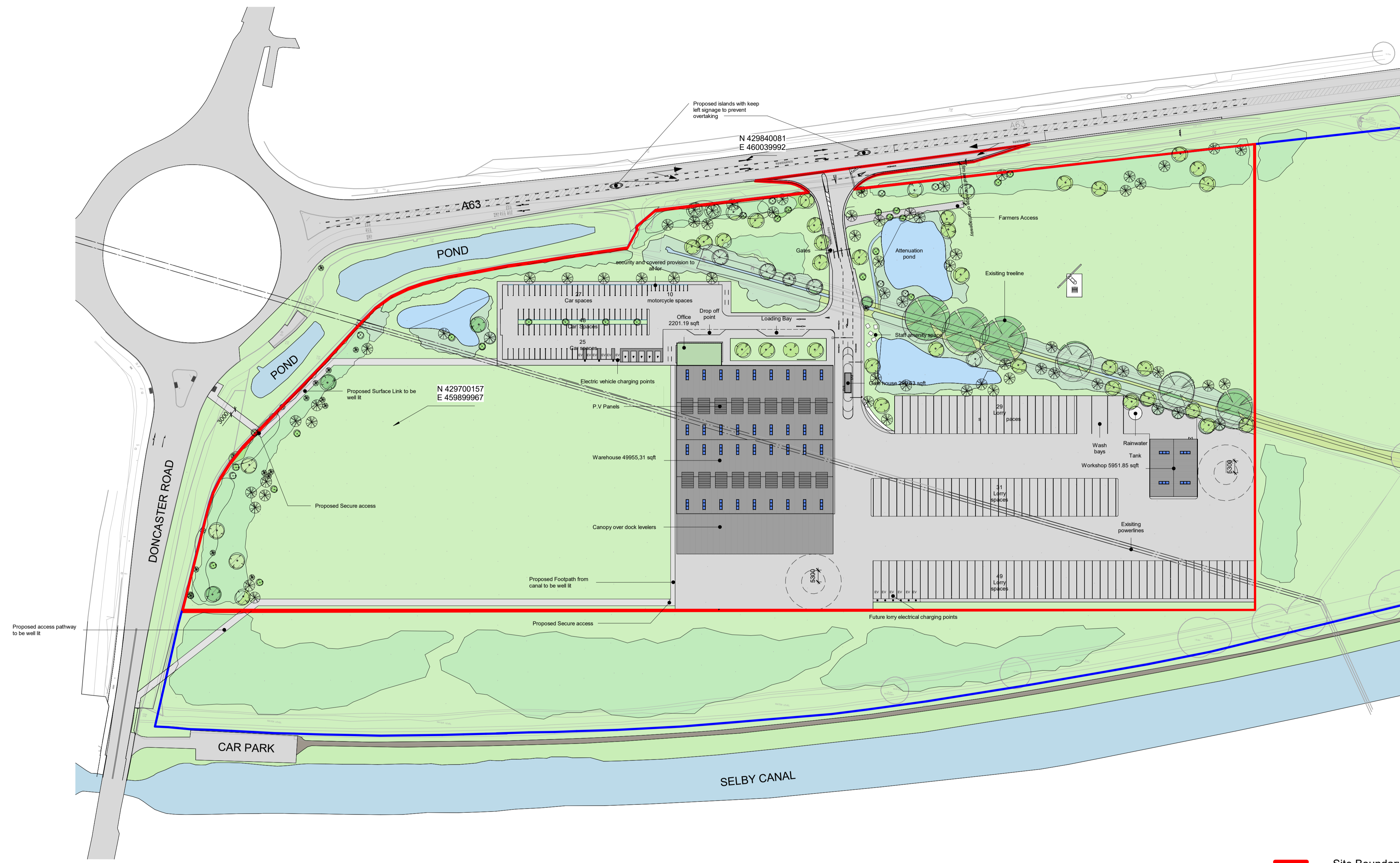
Proposed Site Plan 1 : 1000